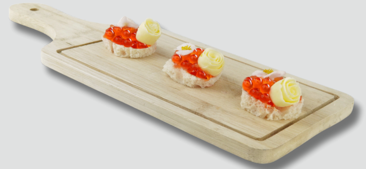
With red caviar and butter