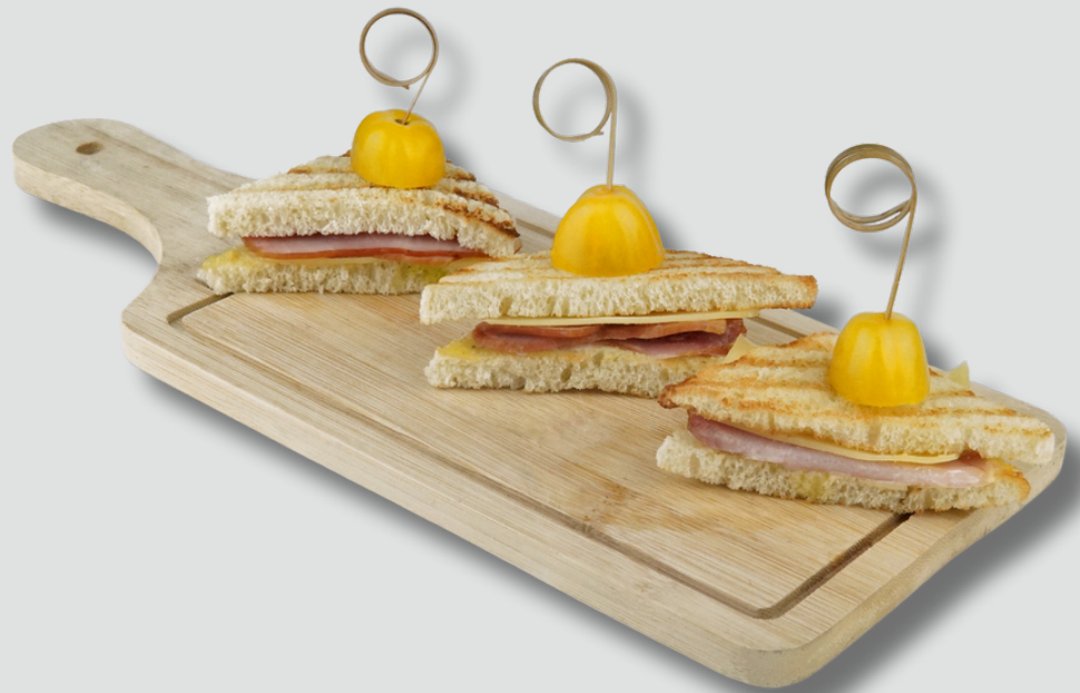
With turkey and cheddar