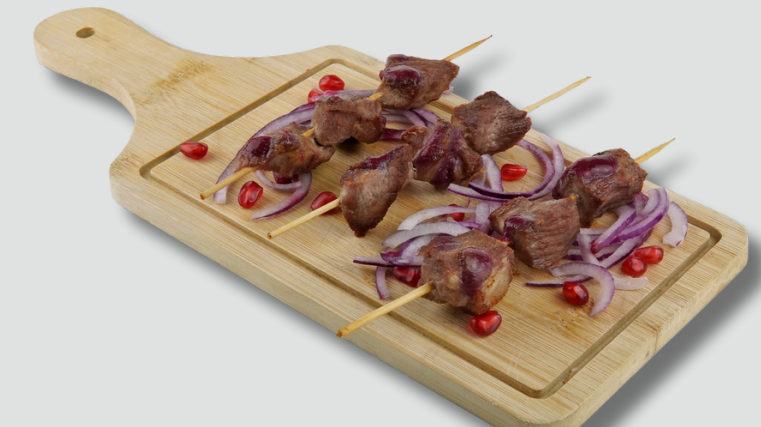
Pork shashlik 4,5 Gel