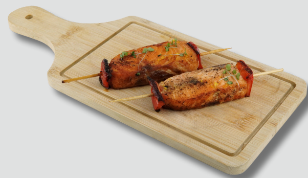
Salmon shashlik with vegetables