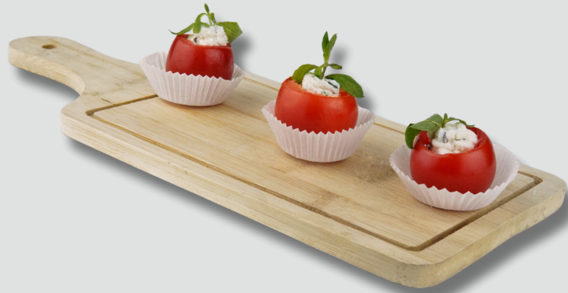
Cherry tomatoes with nadugi