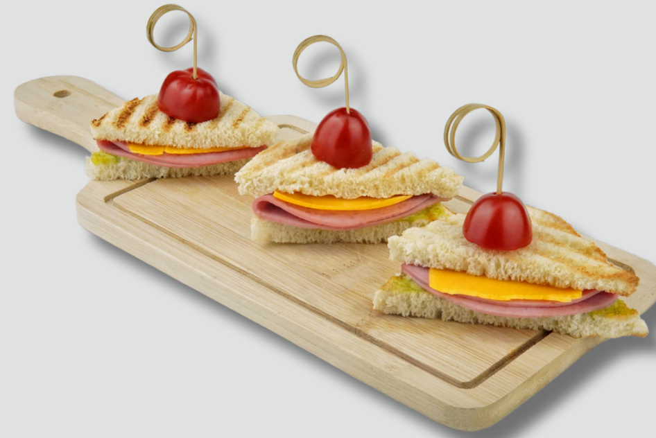
With salmon and cream cheese