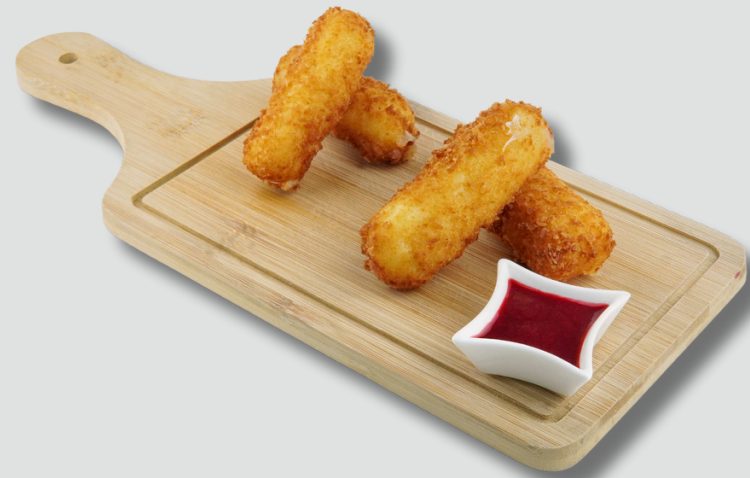
Fried suluguni with berry sauce 3,5 Gel