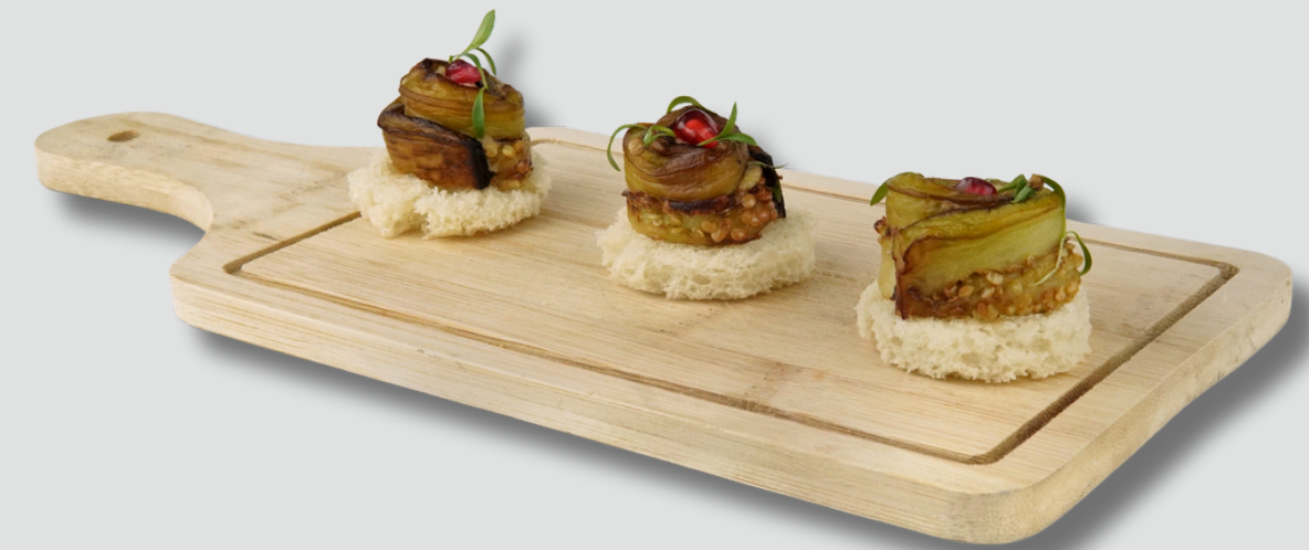
Eggplant with walnuts