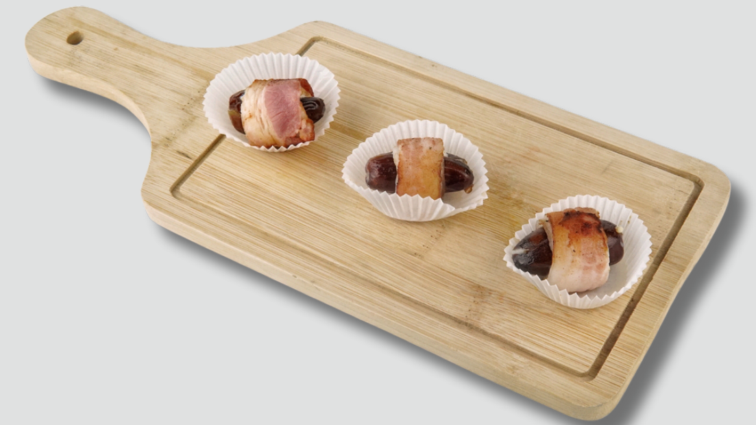
Dates with Bacon and Cheese 2 Gel