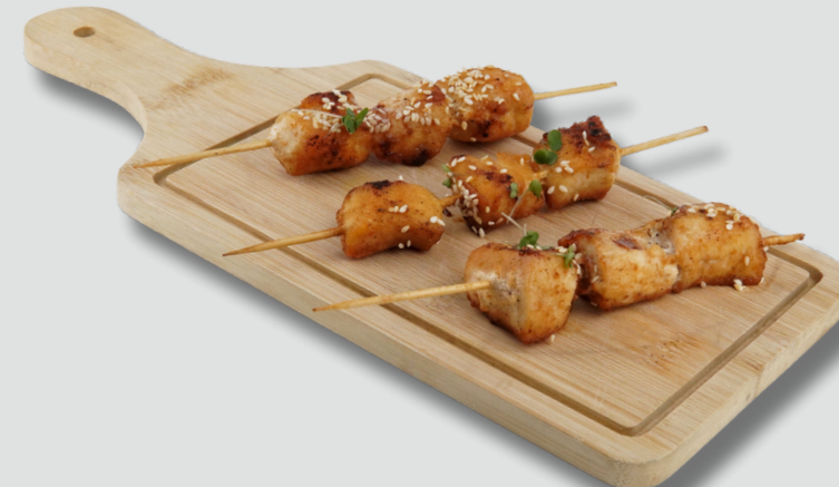
Chicken shashlik 4,5 Gel