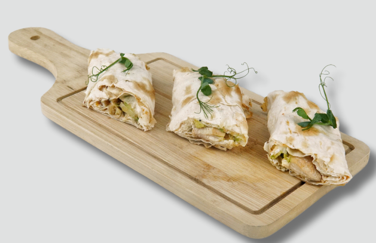
Chicken and Avocado Rolls 3 Gel