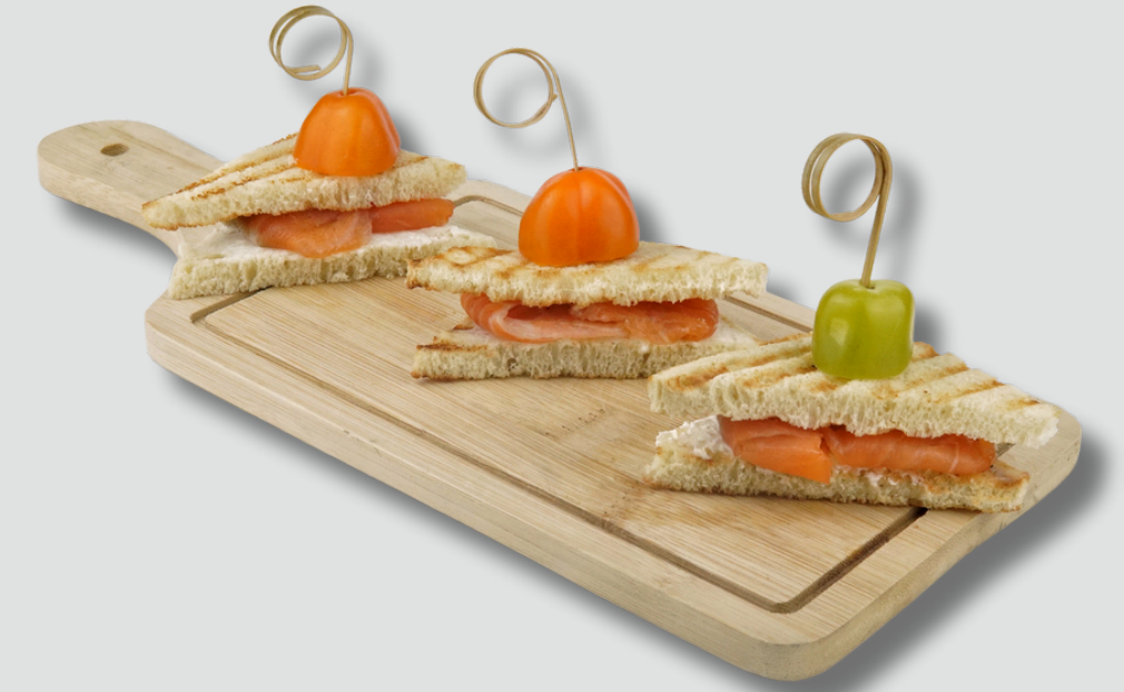
With ham and cheese