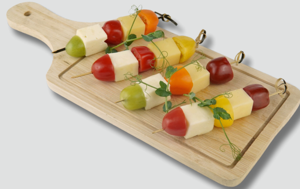
Cheese (Gouda, Suluguni) with cherry tomatoes