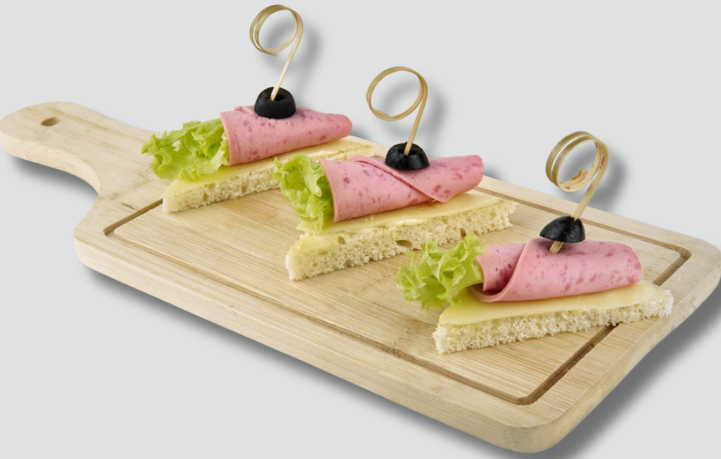
With ham and cheese 2 Gel