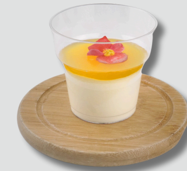
Panna cotta mango