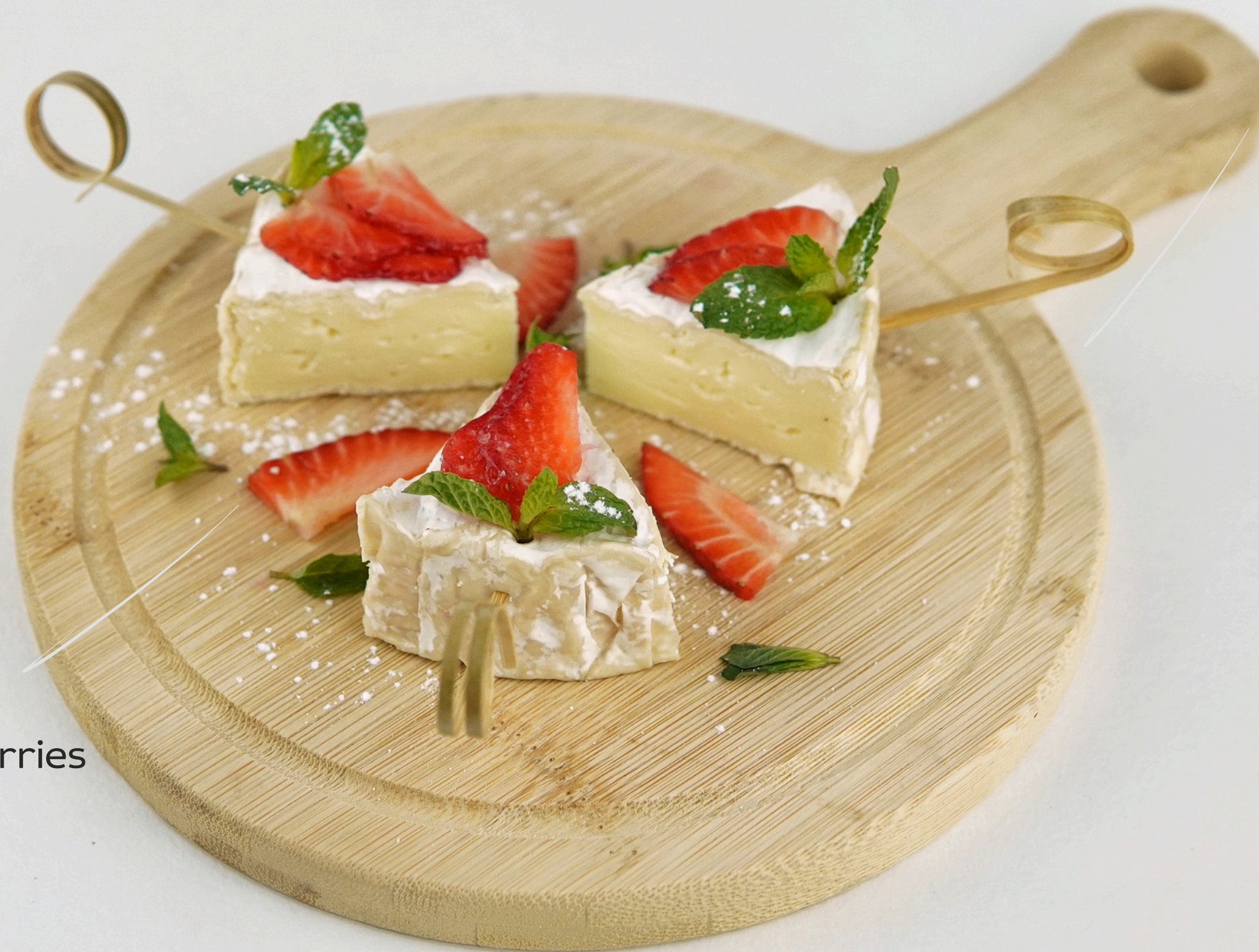
camembert with berries 6 Gel