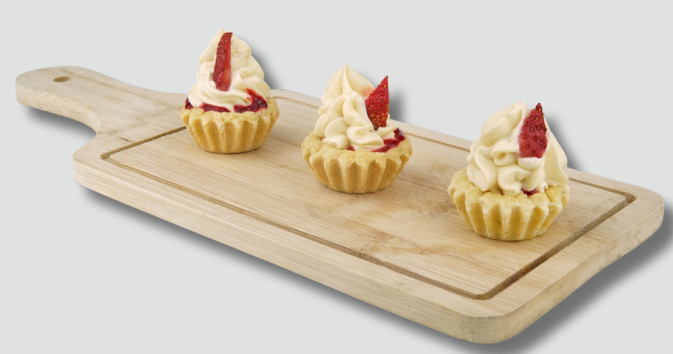
Tartlets with custard and berries