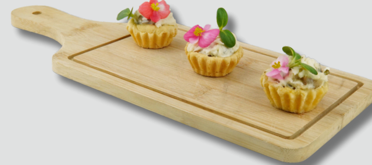
Tartlets with casserole