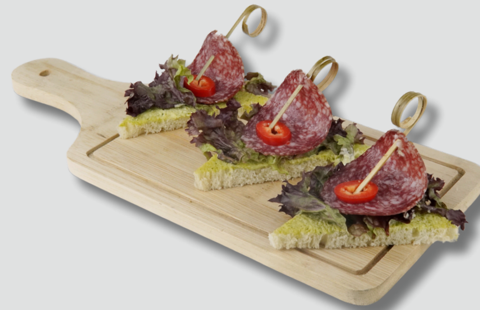
With "Salami" and pickled cucumber 2 Gel